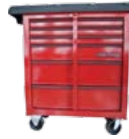
Roller Cabinet WaterlooML1376TF