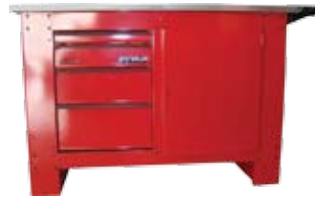
Work Bench WaterLooWB4040B