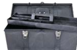
Structural Foam Tool Box Proto9902