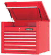
6 Drawer Top Chests Proto453427-6RD