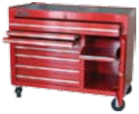
8 Drawer Work Station Roller Cabinet Proto45025