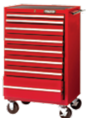
8 Drawer Roller Cabinet Proto442742-8RD