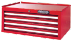
4 Drawer Top Chests Proto44106