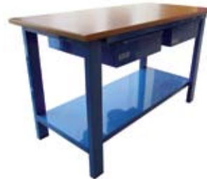
Work Bench OMCN-1002/PL