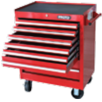
27" Roller Cabinet 7 Drawer Proto442742-7RD