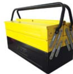
Tool Box 18" STANLEY1-94-738